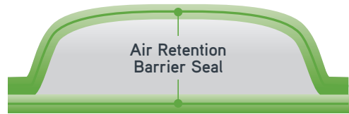
Sealed Air® Barrier Bubble® Retains Cushioning Thickness