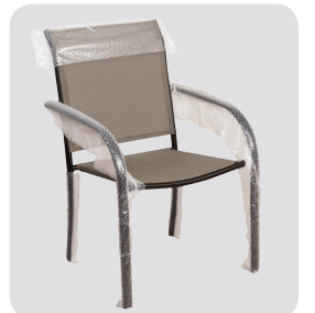
Cold Seal® Bubble Wrap® Brand Cohesive-Coated Cushioning