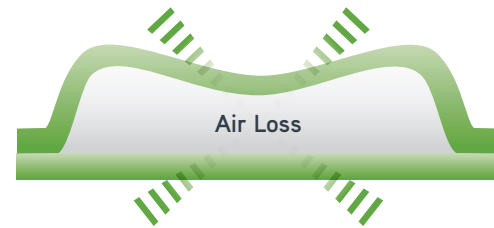
Other Non-Barrier Brands Lose Cushioning Thickness