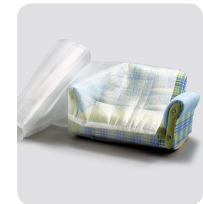
3rd Web Bubble Wrap® Brand Laminates