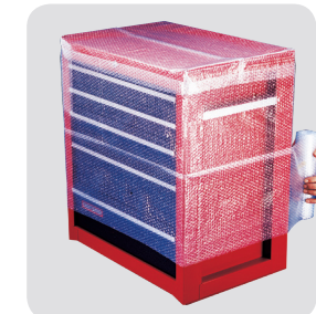
Bubble Mask® Adhesive-Coated Cushioning